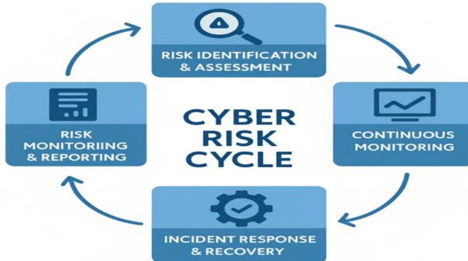
Figure 1: Cyber Risk Life Cycle

4.5.1 Licensees must adopt a structured Cyber Risk Lifecycle that ensures risks are consistently identified, assessed, mitigated, monitored, and reported across the organization (Figure 1). This lifecycle must be embedded within the three lines of defense, with clear accountability for execution, oversight, and independent assurance.