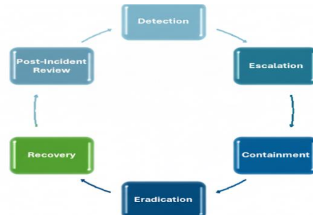
Figure 2: Incident Response Cycle